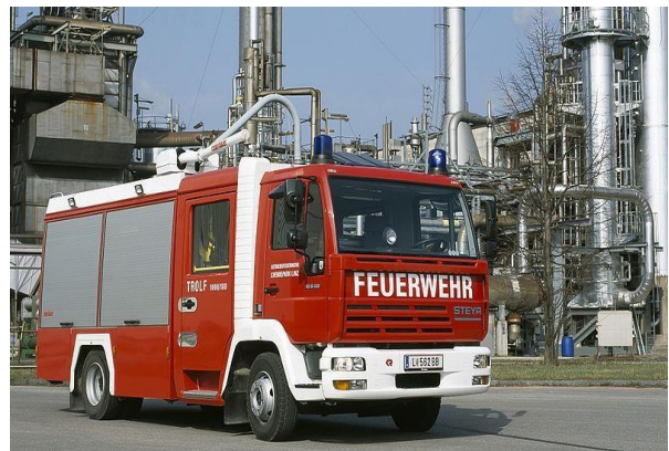
Dry powder fire trucks