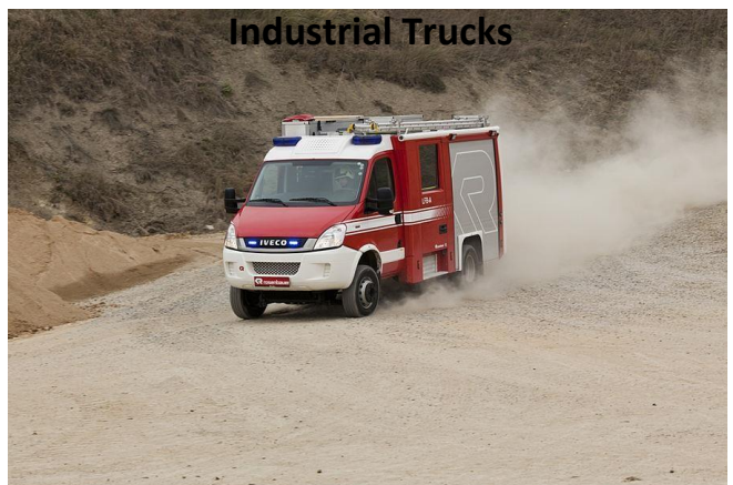
CL Compact Line