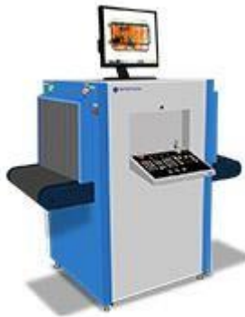
MAIL & SMALL PARCEL