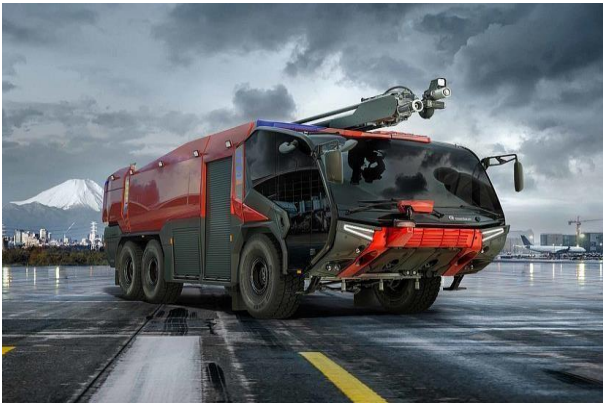
The new PANTHER

Rosenbauer ARFF vehicles are persuading everyday across the world. Rosenbauer is well equipped for your airport fire department - make your choice.