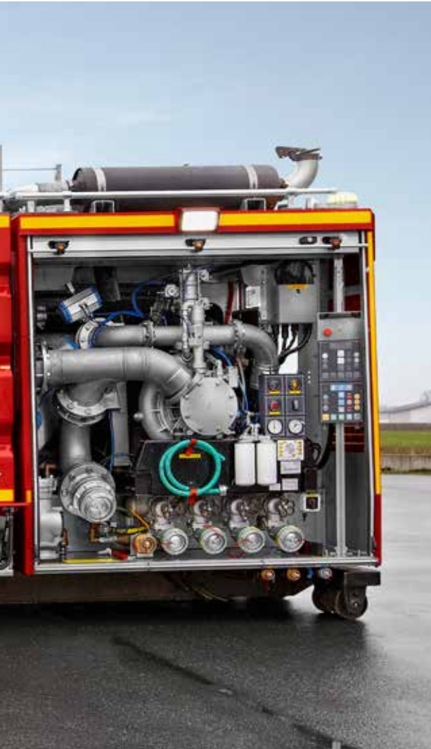
Rosenbauer assembles individual roll-off containers for every fire department. The substructure forms an L-base frame in accordance with the valid DIN standards.