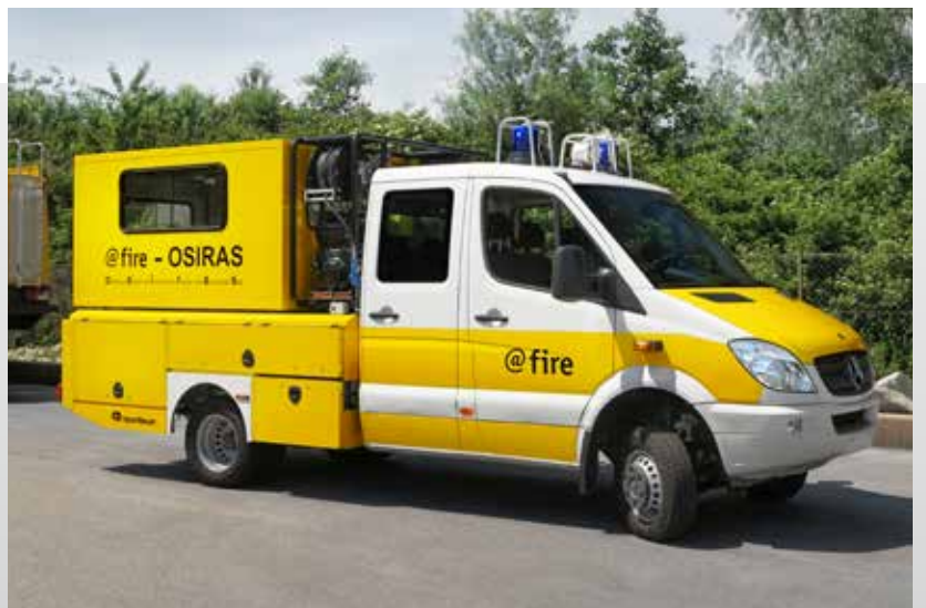
With the flexible Osiras system, fire departments can extinguish, rescue, transport, or protect. The modular body concept for series vehicles consists of three parts: the fixed tool boxes mounted on the vehicle, an extinguishing system tank module in its own frame, and a swap body, which can be transported on any pickup regardless of the carrier vehicle.