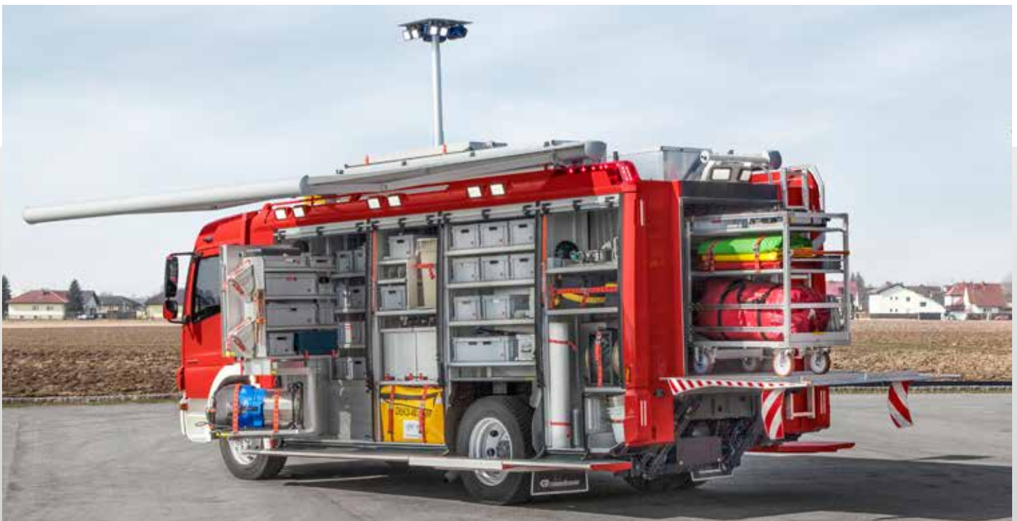
The Decon vehicle is a specialty vehicle for the decontamination of a high number of people and equipment in large HAZMAT operations (D3). The Decon comprises pre-cleaning, main cleaning, and regeneration. Additionally, a weather station and a remote-controlled video camera system can be installed.