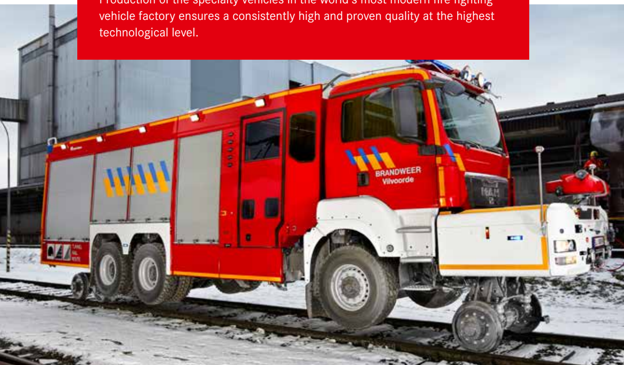
Rosenbauer manufactures specialty vehicles for fire departments according to state-of-the-art methods.

Production of the specialty vehicles in the world's most modern fire fighting vehicle factory ensures a consistently high and proven quality at the highest technological level.