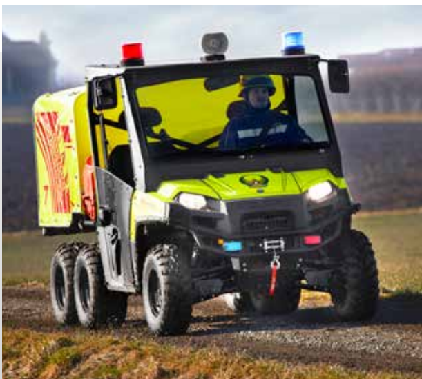
Where other multi-track fire fighting trucks can no longer penetrate, quads from Rosenbauer can venture directly to the operation site. With two models, the ATV (All Terrain Vehicle) POLY QUAD SL100 CAFS with POLY CAFS fire fighting equipment and the UHPS ATV on a Polaris Ranger 6x6 chassis, Rosenbauer offers performance in the smallest space for a variety of requirements.