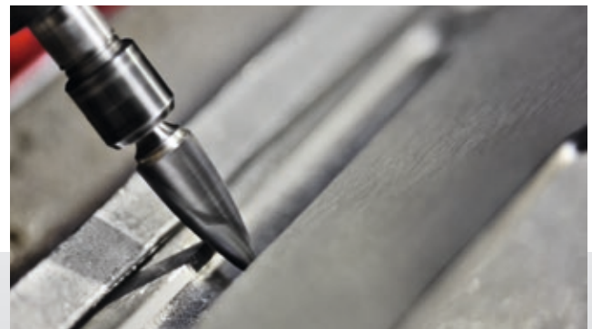
Precision and customization