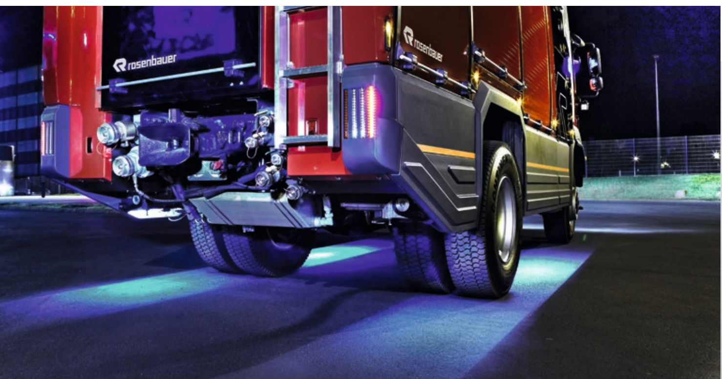
Ground contour lighting

The ground contour lighting switches on when the parking brake is engaged. So the crew can see where they are walking even with dark, damp, or dirty ground conditions. If the equipment compartment flap is open, the light stays on and lights the steps.