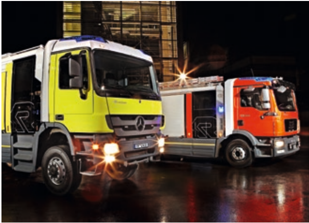
Flexible body module for individual solutions