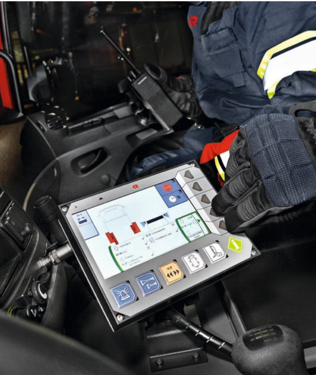
Operating display in driver's cab

Operating with just a few steps Fast. Efficient.