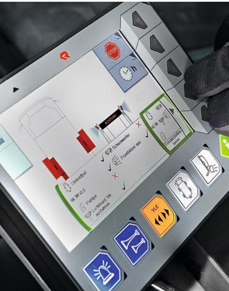
Everything under control at the press of a button