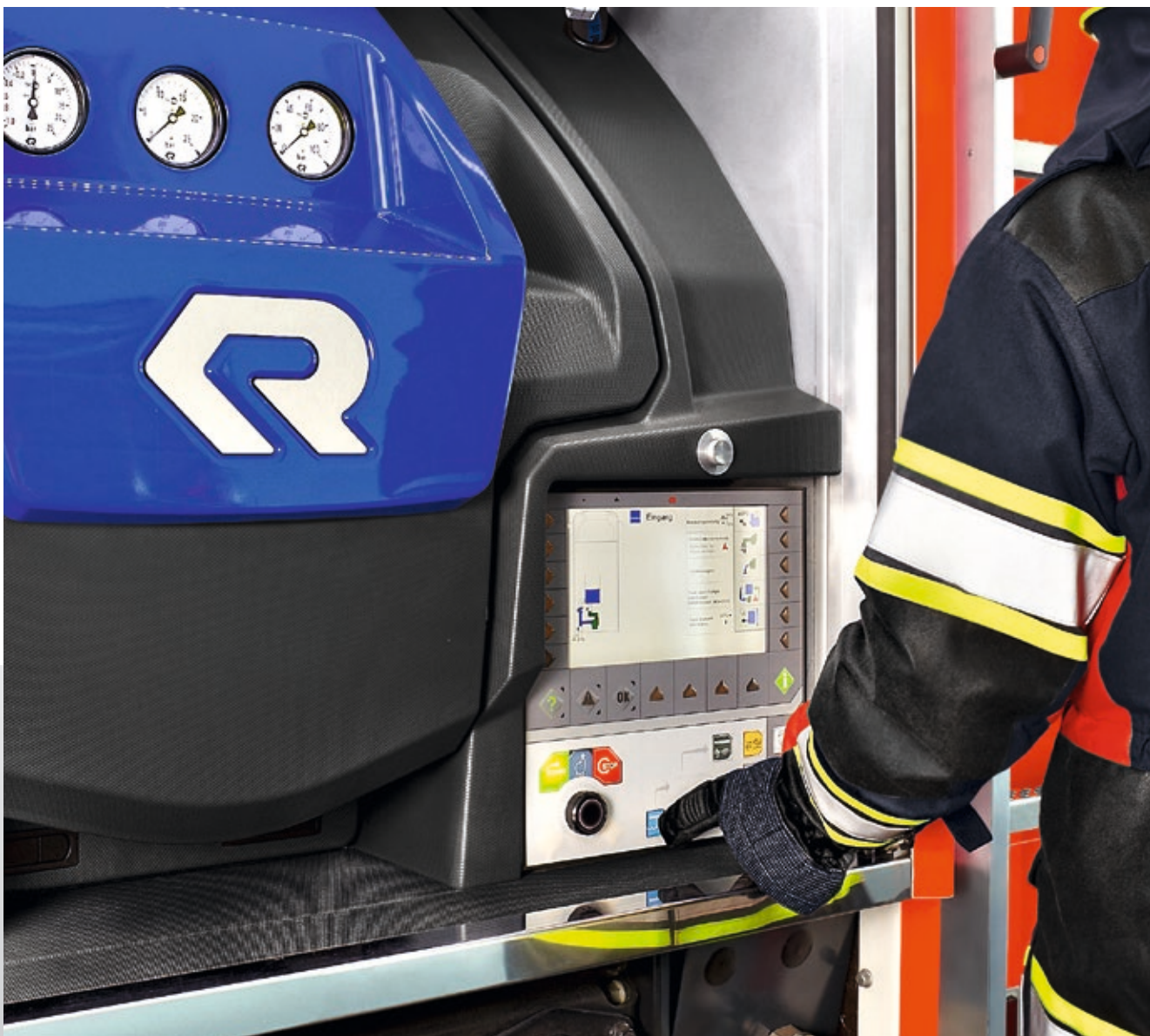
Operating display in rear

Virtually all devices such as engine, pumps, traffic control device and light mast can be easily, quickly, and clearly operated via the rear LCD flat screen of the AT. Important information can be called up on the devices at the same time.