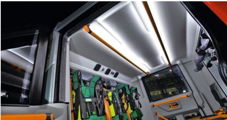
Crew cab lighting with LED

A majority of operations take place at dusk or in darkness. The AT is fitted with a special lighting concept that produces daylight-like lighting conditions, even in the dark. It increases safety and efficiency during the operation. The lighting technology is based on LED technology and provides light where it is needed. Daylight-like conditions are created in conjunction with underfloor, scene, and equipment compartment lighting as well as the light mast. LED does not glare and is extremely energy-efficient. Natural colour perception, less shadowing, and homogeneous illumination of the whole scene facilitates working at night.