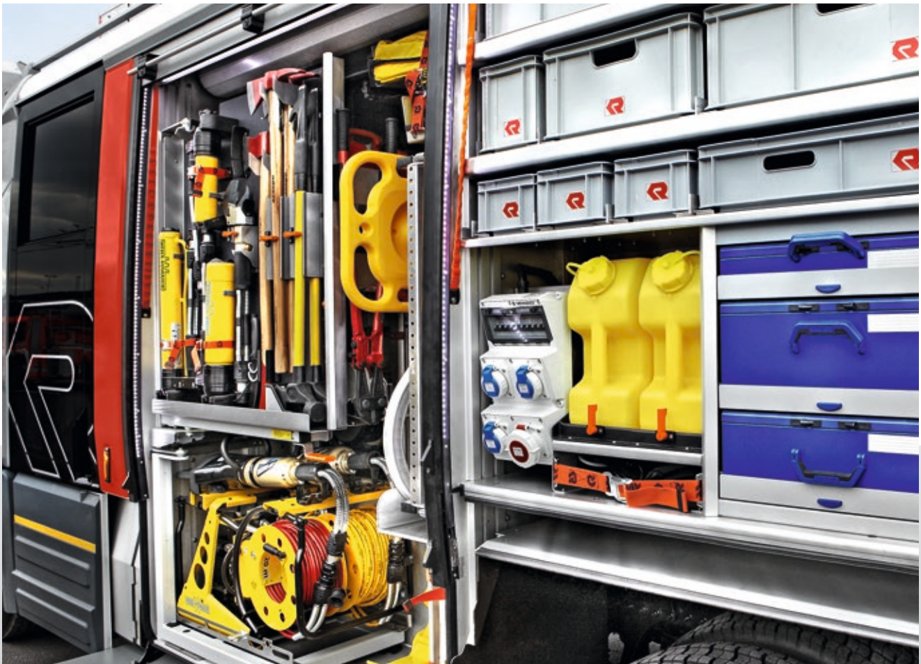
More storage room for equipment through optimum space utilization

The body module width and height are ideally adapted to the various chassis types. Even in the narrowest old town alleys the vehicle can still move well thanks to the short overhang.