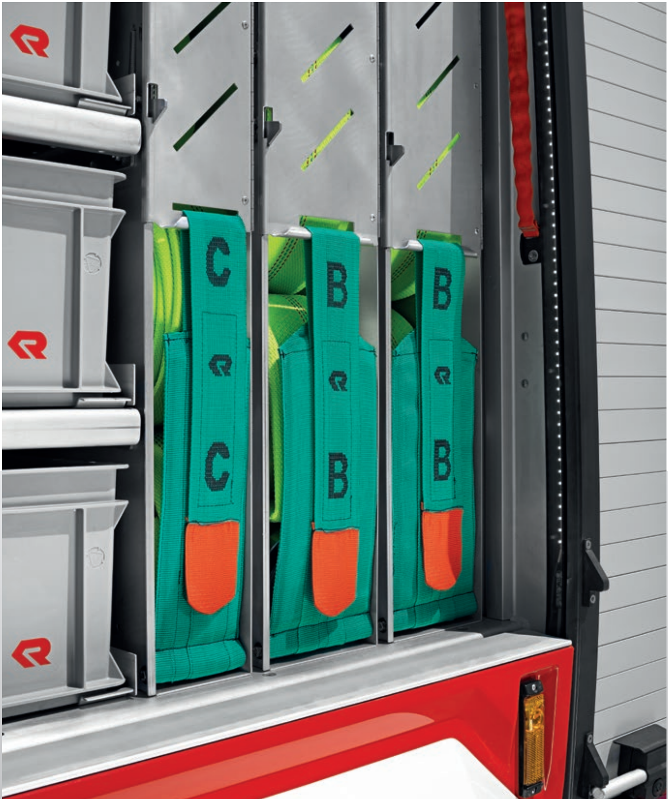
The hoses are stored above one another in the magazine

With the hose magazine, hoses are no longer stored next to each other, but above one another: once the first hose has been pulled out, the next one automatically slides downwards for removal. This saves time, space, and significantly simplifies the removal. In addition, the equipment compartment is then optimally utilized from top to bottom.