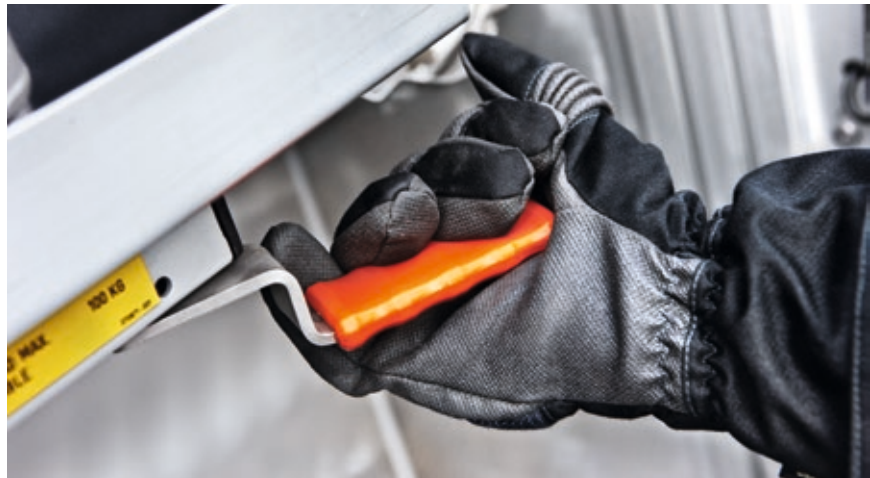
Quick and easy removal of equipment

The holder system enables the quick and easy removal of equipment. The uniform colour concept also simplifies the work. All operational and graspable devices are marked with the signal colour orange.