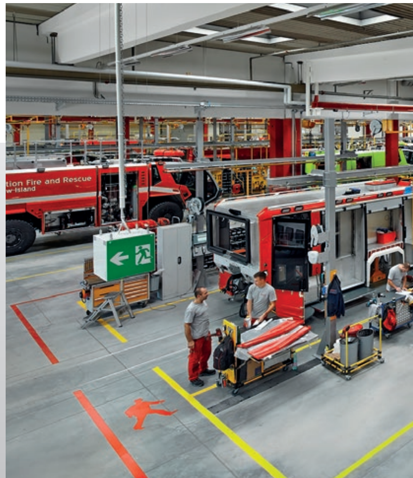
State of the art production halls at all locations

To build more innovative fire fighting vehicles, we work with the latest materials and use state of the art production methods. We ensure high quality by industrial fabrication in our ultra-modern production sites in Austria and Germany. All components – from vehicle body and extinguishing technology right through to the equipment – are developed, constructed, and built by Rosenbauer. The integrated solutions are optimal coordinated for maximum performance and reliability. The robust, all-terrain, light, and space-saving fire fighting vehicle superstructures from Rosenbauer set standards.