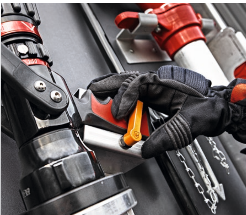
Nozzle – unlocked in one step