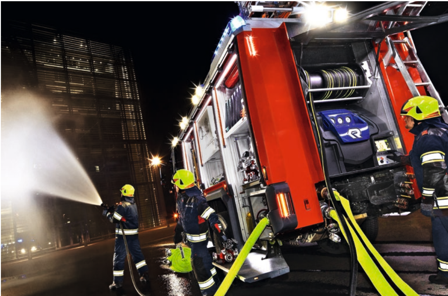
Easy handling, powerful extinguishing