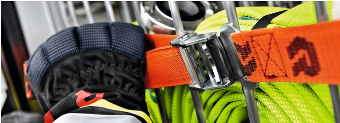
Uniform colour coding