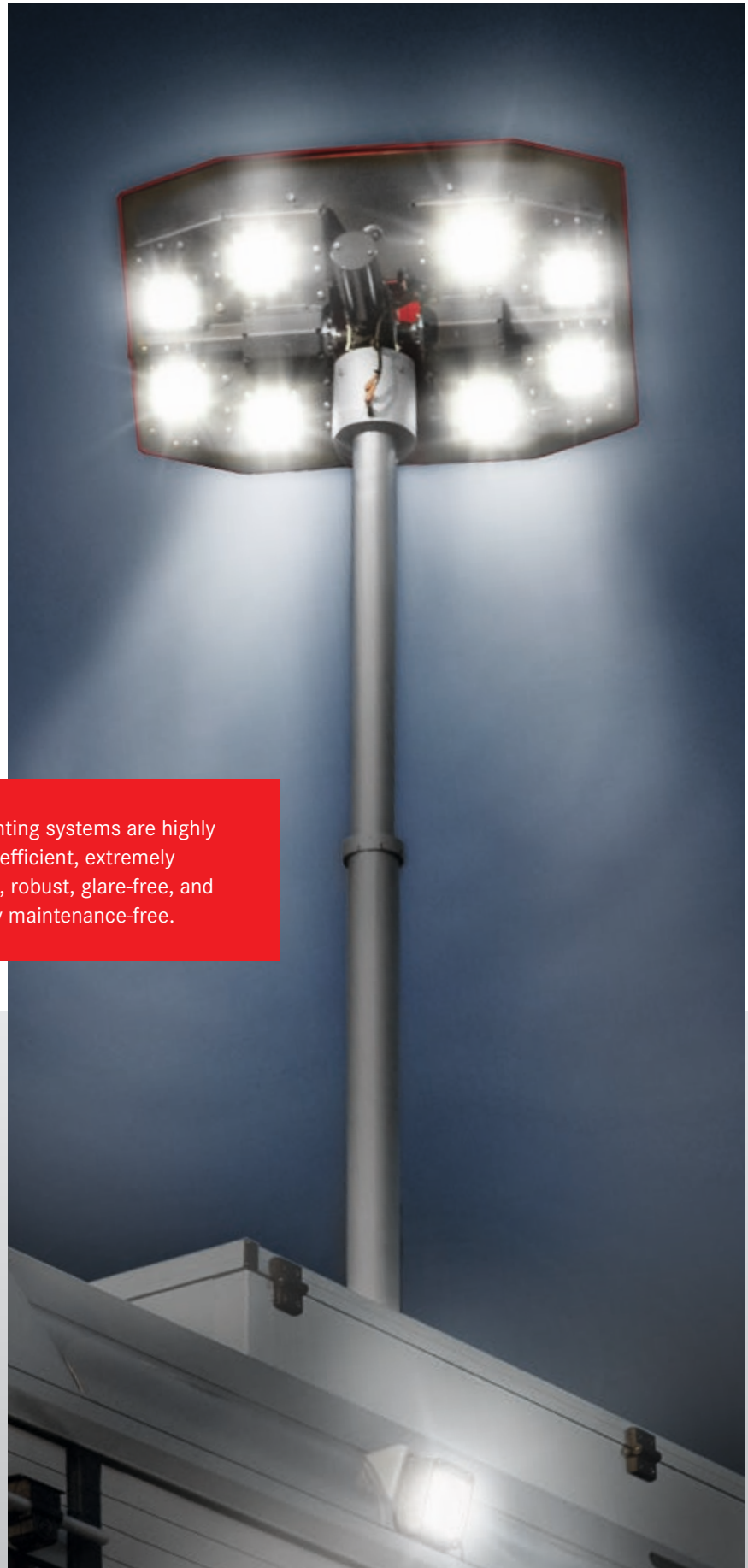
FLEXILIGHT LED illuminates everything

The light mast can be fitted with halogen, xenon, or optionally with eight LED modules. The LED light mast stands for maximum illumination with low power consumption and a long service life.