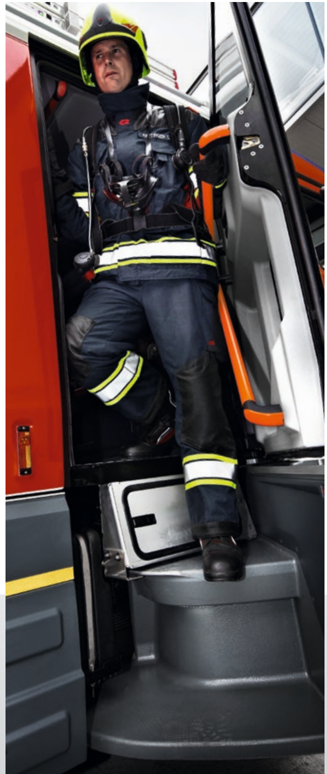
Safe entry and exit in every situation