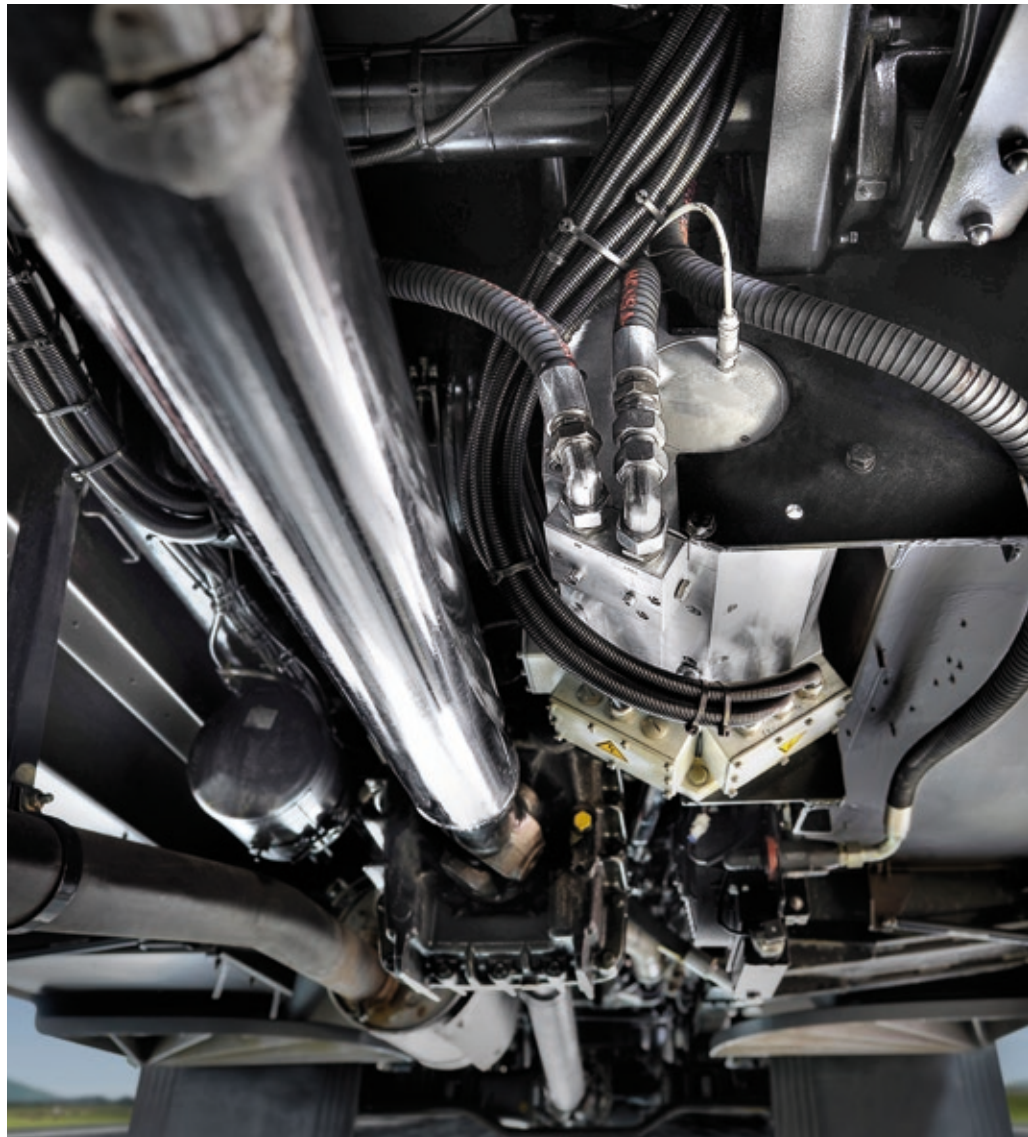
Space-saving generator installation in the frame

The innovative and patented EPS is a completely new way of powering all consumers in the vehicle right through to the centrifugal pump. Via a high-performance generator directly on the second PTO, electrical energy is produced at high power – depending on the chassis up to 80 kVA. Direct injection foam proportioning systems, CAFS compressors, and all consumers are then supplied with a 230 V or 400 V electric drive via the converter. In addition, the vehicle can be used as a mobile emergency power supply. The individual components are stored in the body module or in the frame to save space, thus leaving more space for the equipment.